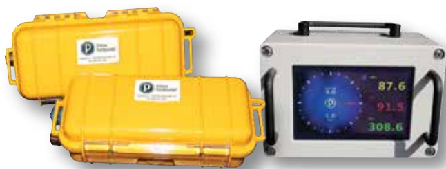
Wireless Driller Display Adaptor with the new touchscreen Wireless Drillers Display