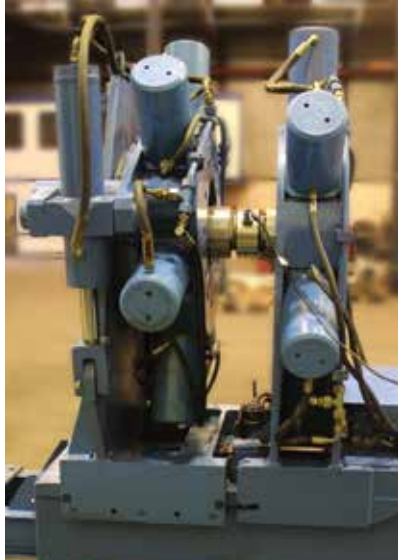
Calibration of Christenson break out unit