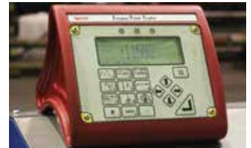
Torque cell readout

At Prime Horizontal we have the experience and tooling to carry out the required yearly torque calibration on so much Drill Rigs as Break Out units.