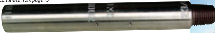
The Axial Magnets used for final approach to the underground intersection point

installed as a Bit Sub in the north pilot hole. The Axial Magnet was then used as the target for the steering tool in the south pilot hole, giving centimetre accuracy of its relative position to the target bore until the relative position went to zero and intercept was achieved.