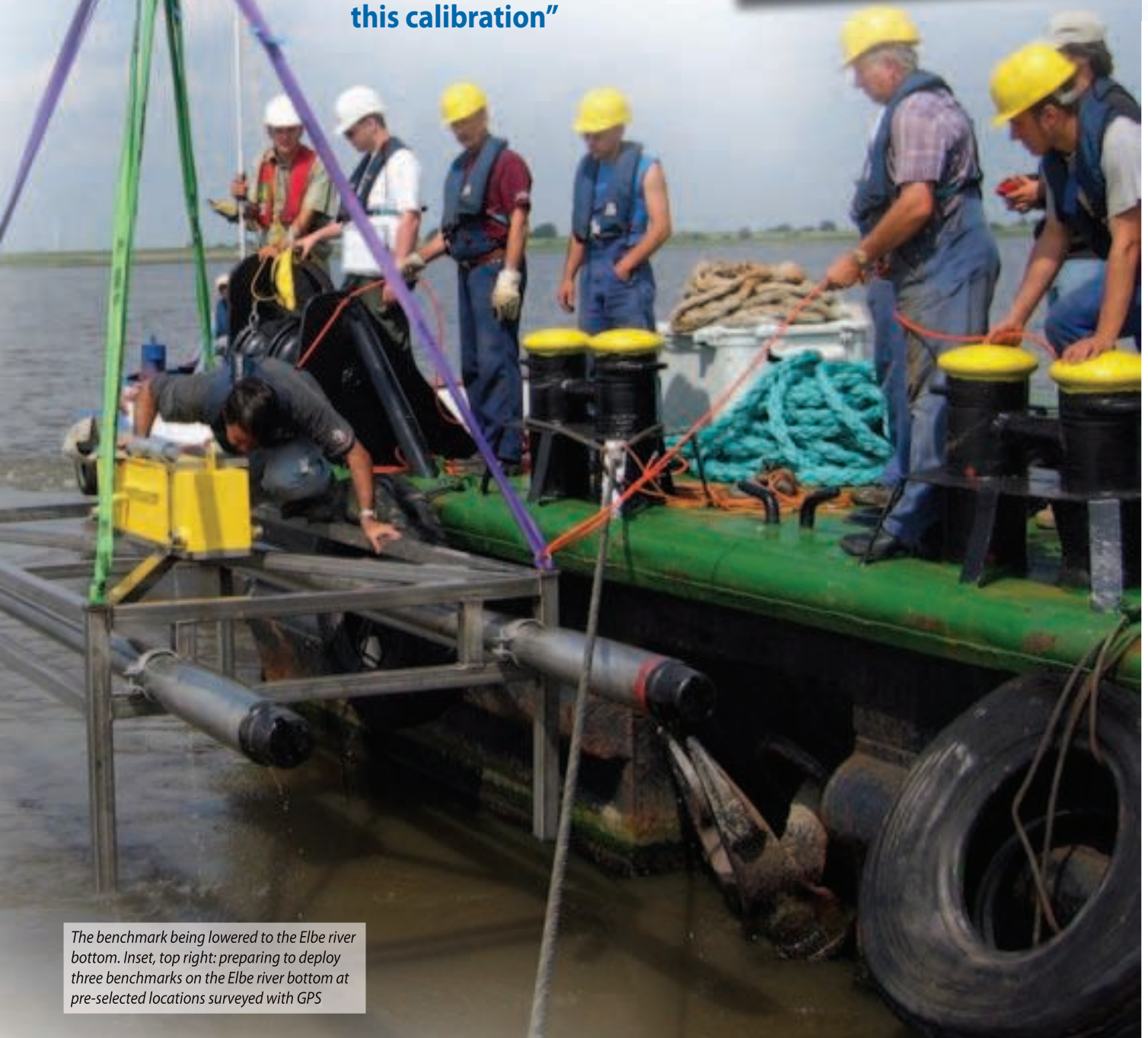
The benchmark being lowered to the Elbe river bottom. Inset, top right: preparing to deploy three benchmarks on the Elbe river bottom at pre-selected locations surveyed with GPS