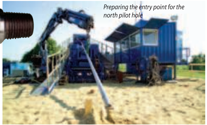
Preparing the entry point for the north pilot hole